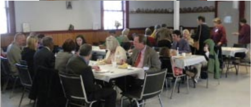
A luncheon to benefit the Youth trip to Perdue