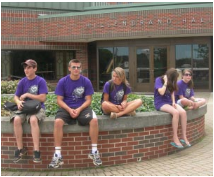
Arrival at Purdue; waiting for advisors to register us.